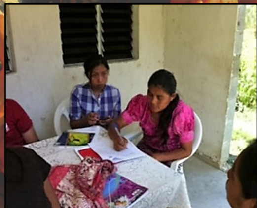
Signing the covenant between FPC and Iglesia El Shaddai.