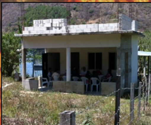
The beautiful building in Chiac where the water will be installed.