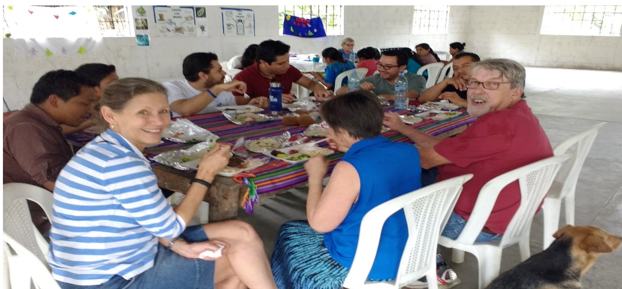
Lunch: Day One