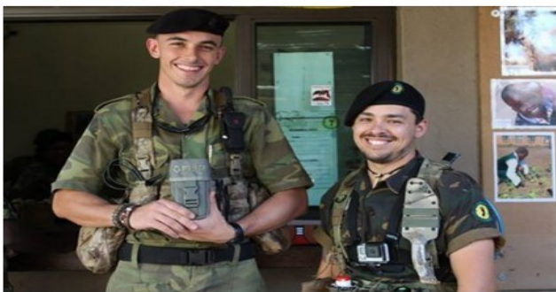
Protrack Anti Poaching Unit Volunteer Work and Work Experience April 14 at 6:16am · 📷

If you can donate fruit, eggs, oil or juice for the breakfast, please see Marla Knight-Dutille.