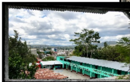
Ernesto Chavarria Rivadeneyra School in Sanarate