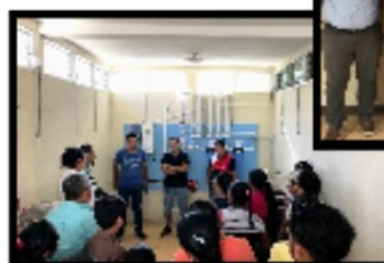
System Training in Water Building