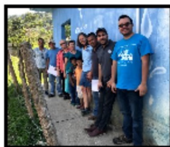
Chiac's Water Building

2 Next we travel to see our partners in the village of Chiac, site of our first system, installed in 2016.