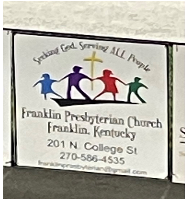
Our FPC banner on the fence at the football stadium at FSHS.