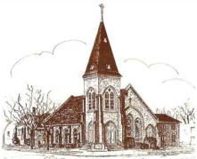
Franklin Presbyterian Church Franklin, Kentucky

Franklin Presbyterian Church 201 North College Street Franklin, KY 42134