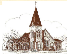
Franklin Presbyterian Church Franklin, Kentucky

Do you have something to go in the December Lamplighter? Submit it to the office by Monday, November 27.