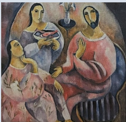
LESSON TWO: Mary "of a Certain Village"